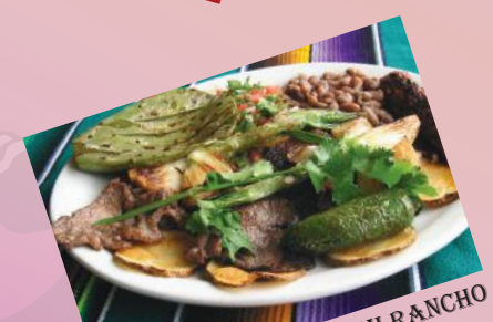
PLÁTILLO MI RANCHO