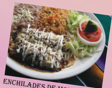
ENCHILADAS DE MOLE