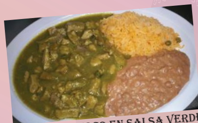
LOMO DE PUERCO EN SALSA VERDE

A deep fried tightly rolled burrito stuffed with your choice of meat and melted cheese, covered with sour cream