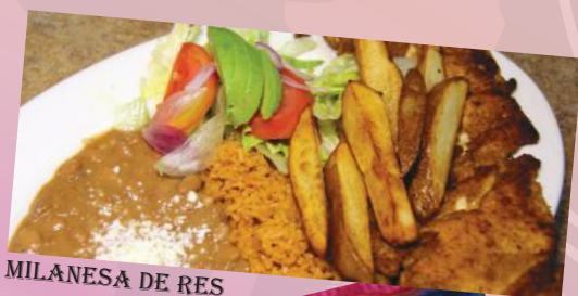
MILANESA DE RES

Thin breaded steak served with french fries, side of salad, and avocado slices