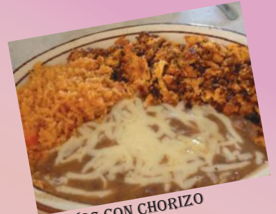
HUEVOS CON CHORIZO

Two sunny-side up eggs over a corn tortilla with steak, served with our homemade Mexican style potatoes and covered with hot sauce